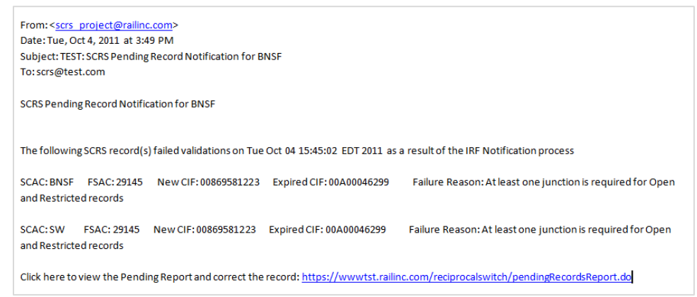
Exhibit 35. SCRS Pending Record Notification Email

Use the following procedure to view SCRS Pending Records Reports from within the SCRS application: